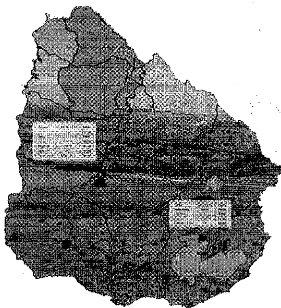
Figure 1: Landscape Units selected as territories for the Project: eco-regions of Cuesta Basáltica (green) and Sierras del Este (magenta).

The two eco-regions most vulnerable to drought and water stress correspond to the eco-regions: i) Cuesta Basáltica (in the north/northwest of the country), where most of the area corresponds to the Departments of Artigas, Salto, Paysandu and Tacuarembó, and ii) Sierras del Este (in the Southeast/East of the country), located mainly in the departments of Treinta y Tres, Lavalleja, Maldonado and Rocha.