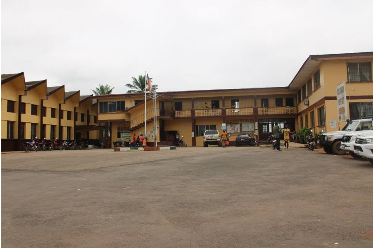
The Gbarnga Administrative Building where the Inception workshop was held.