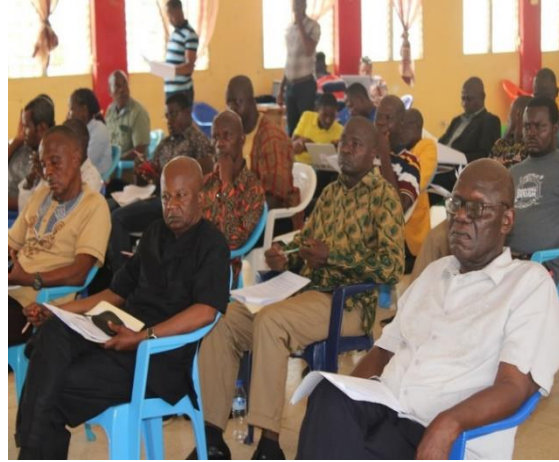
Cross section of participants