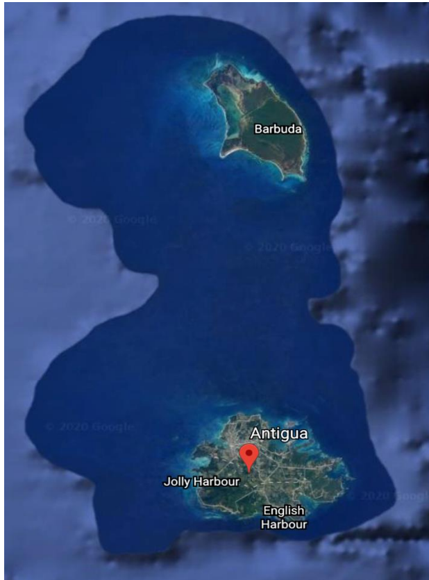
Figure 2 Antigua and Barbuda