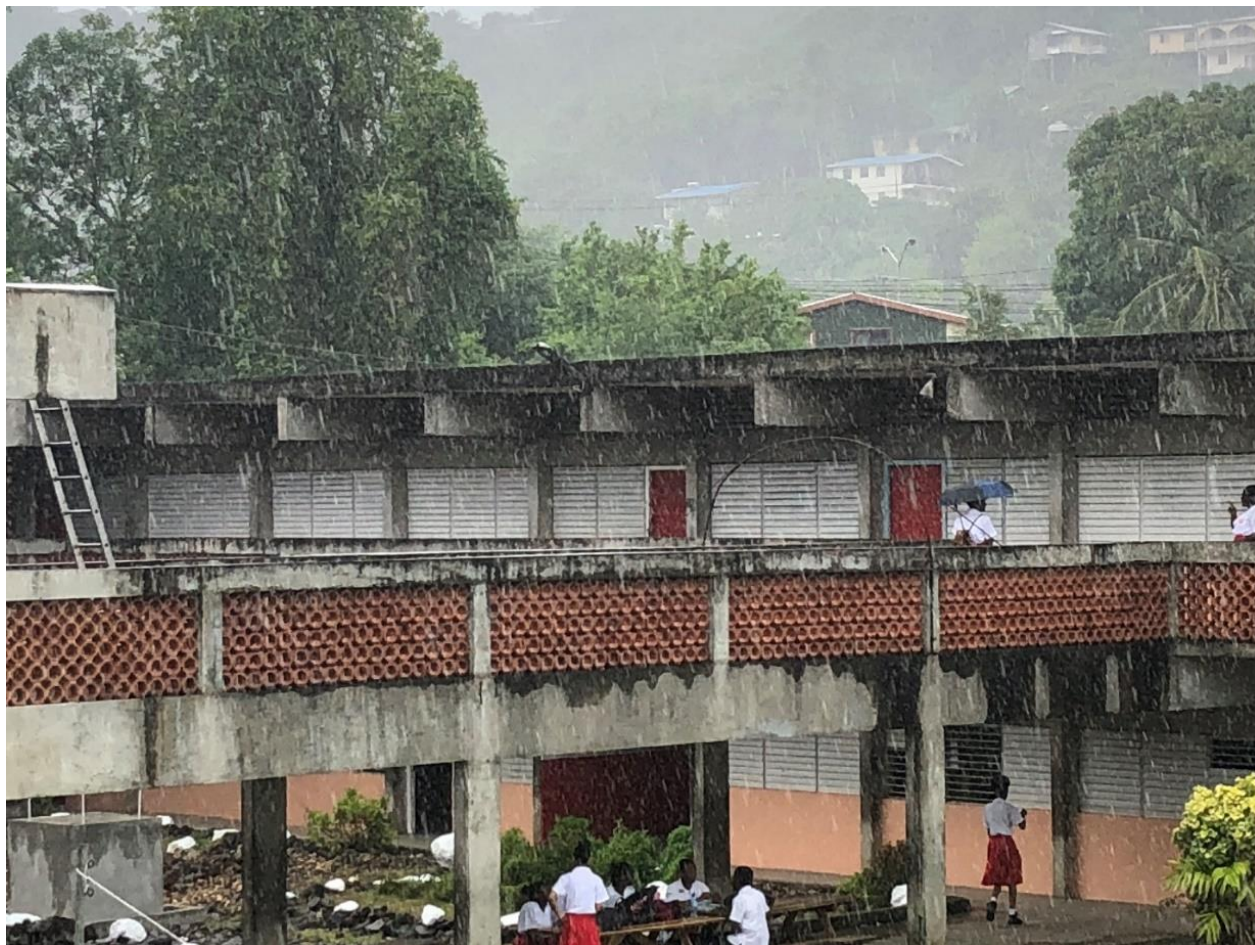
Photo of a public school in Saint Lucia